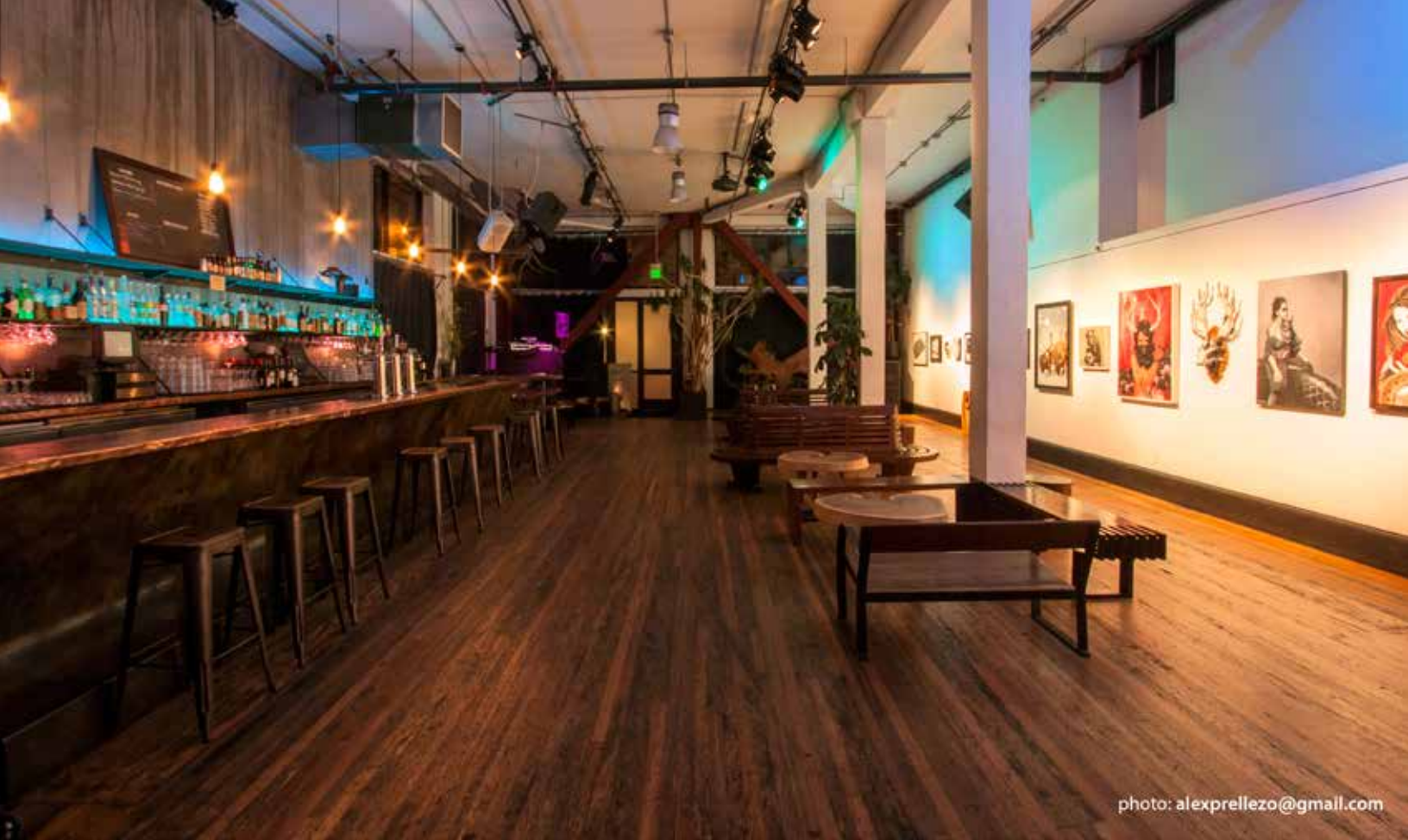
2ND STREET GALLERY (300 CAPACITY)