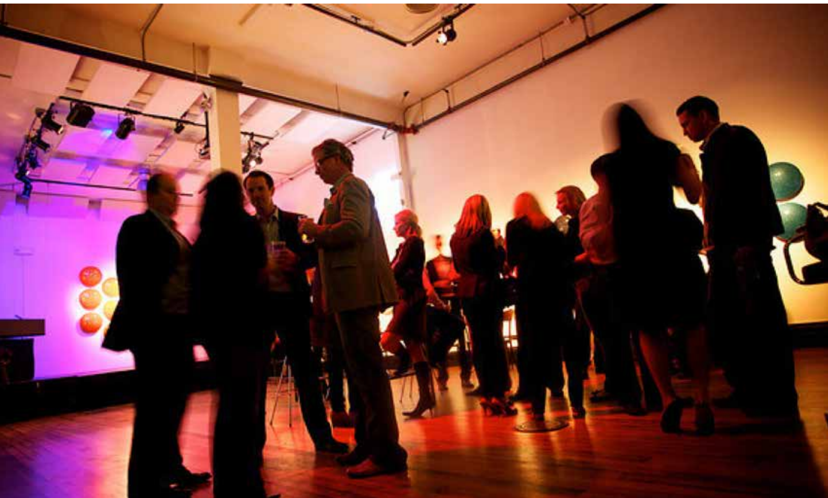
ZAPPA ROOM (200 CAPACITY)