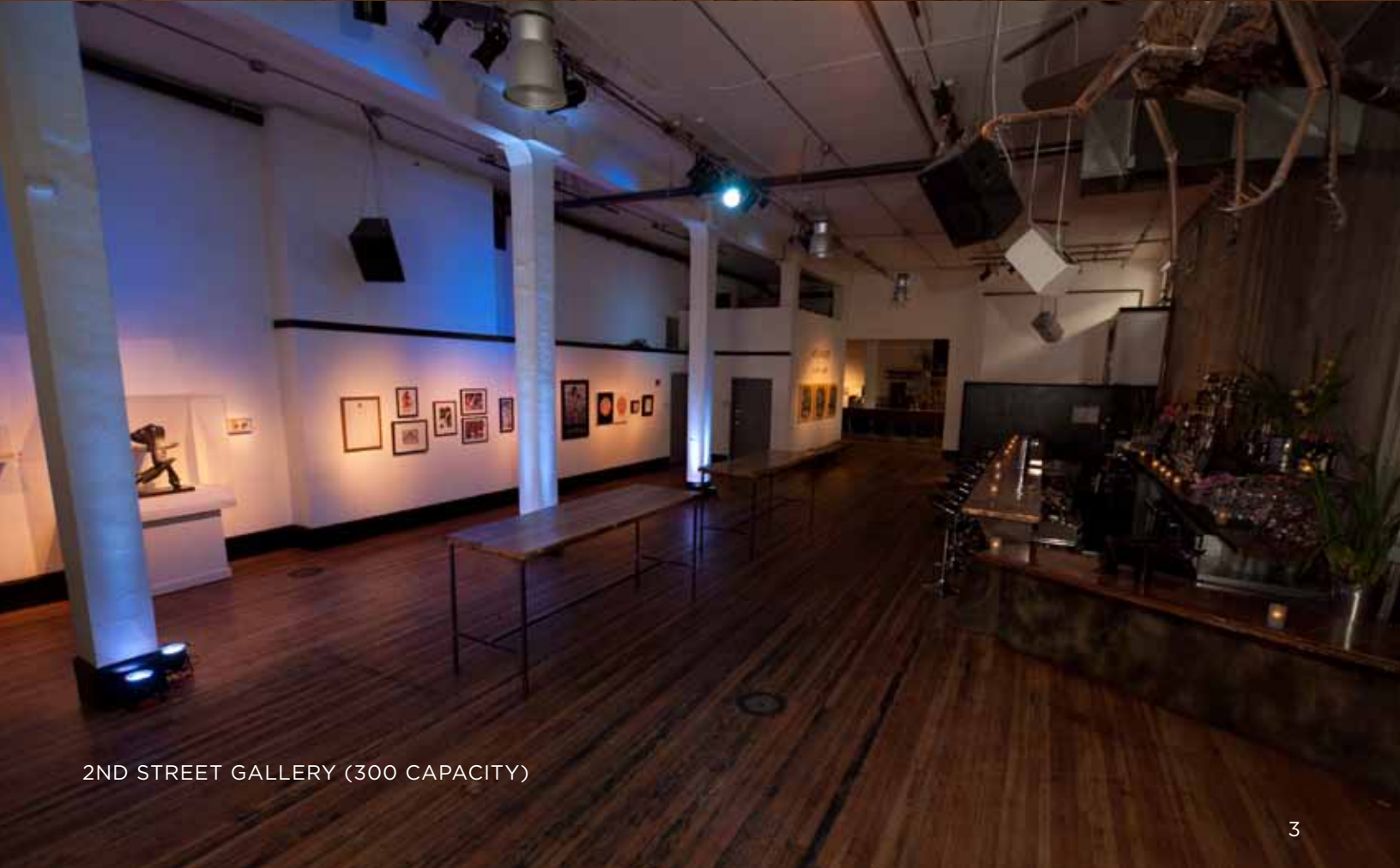
2ND STREET GALLERY (300 CAPACITY)