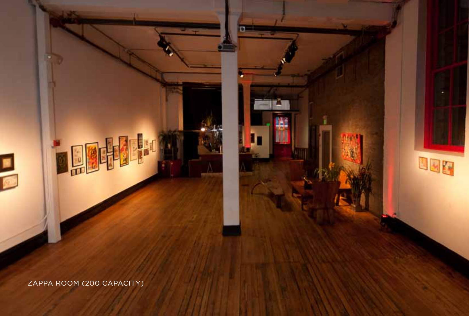
ZAPPA ROOM (200 CAPACITY)